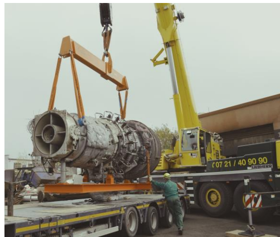
Figure 2: delivery of gas turbine in Karlsruhe